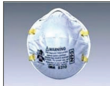
A particulate respirator displaying the NIOSH certification notation.